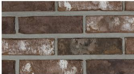
New Heaven Antique